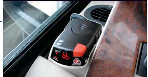
The dual controller doubles as a proportional trailer brake controller, mounts under dash or in a convenient location