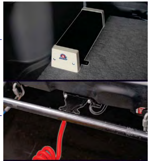
Just plug & go!