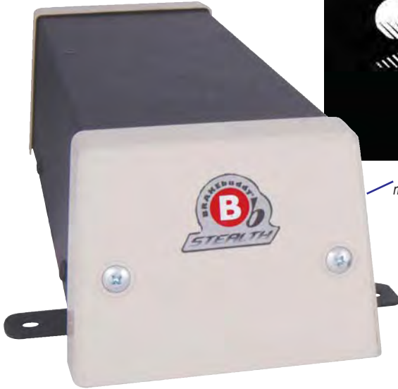
Dinghy main unit