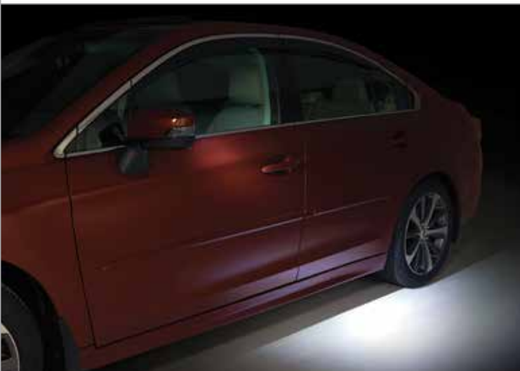
LED Light & Logo