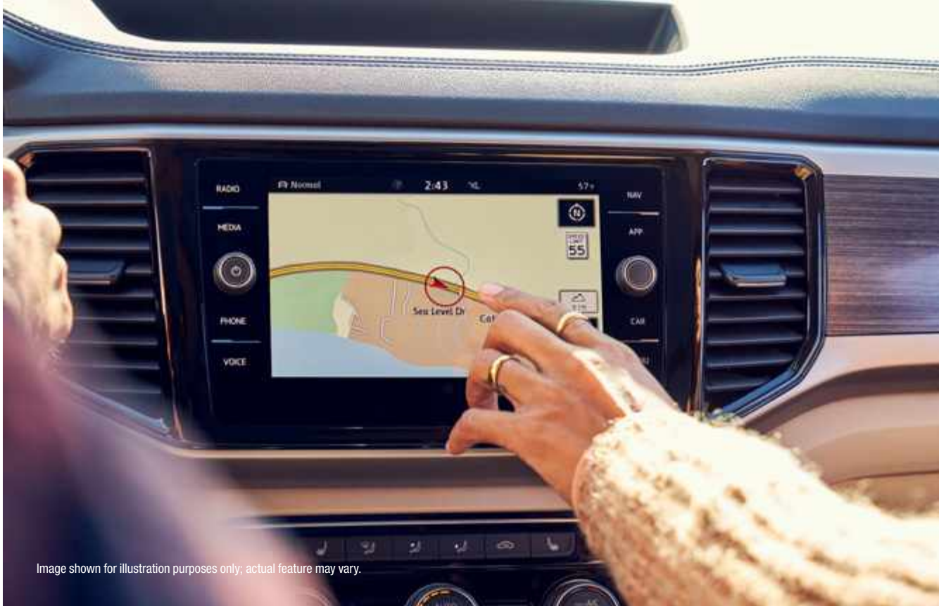
Image shown for illustration purposes only; actual feature may vary.