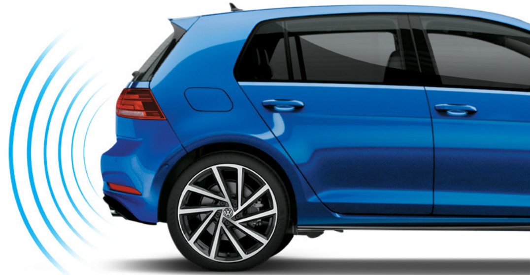
Rear Traffic Alert*

When driving, if you attempt to change lanes, the Blind Spot Monitor can help alert you to cars that may be in your blind spot. The Active Blind Spot Monitor can also counter-steer within the limits of Lane Assist to help keep you in your lane if you attempt to change lanes when a vehicle is in your blind spot.