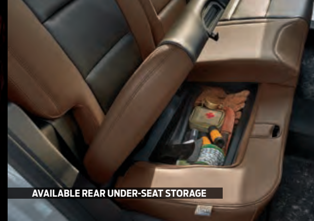
AVAILABLE REAR UNDER-SEAT STORAGE

1. Cargo and load capacity limited by weight and weight distribution.