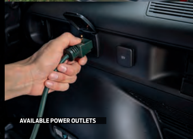
AVAILABLE POWER OUTLETS