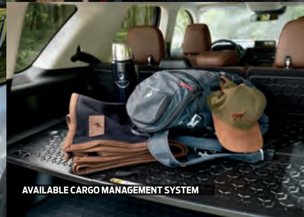
AVAILABLE CARGO MANAGEMENT SYSTEM