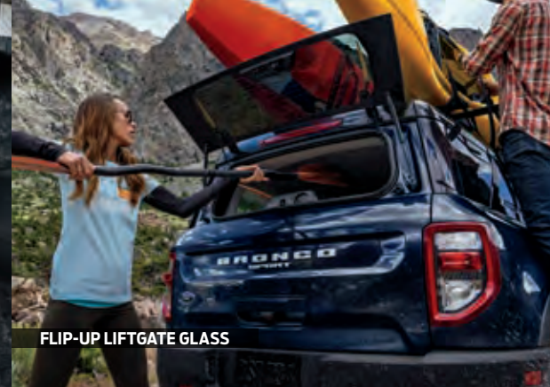
FLIP-UP LIFTGATE GLASS