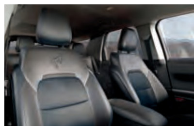
Navy Pier Leather-Trimmed / 1-11 Outer Banks