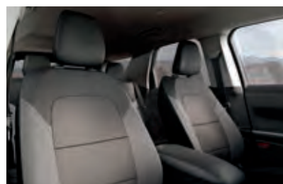
Medium Dark Slate Easy-Clean Cloth / 1-11 Big Bend