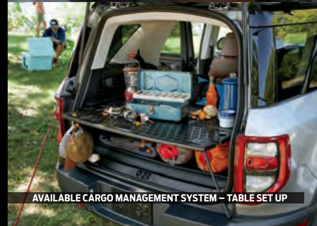
AVAILABLE CARGO MANAGEMENT SYSTEM – TABLE SET UP