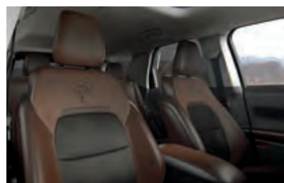
Ebony & Roast Leather-Trimmed / 1-11 Badlands with Premium Package

Colors are representative only. See your dealer for actual paint/trim options. 1. Additional charge.