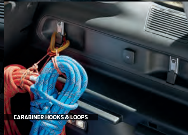
CARABINER HOOKS & LOOPS