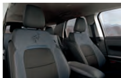
Ebony & Area 51 Cloth / 1-11 Badlands