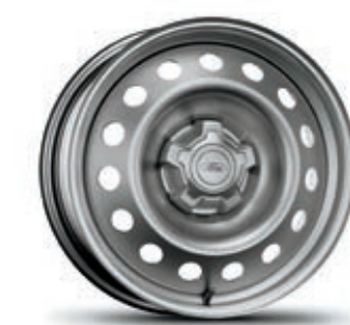
17" Steel XL Standard