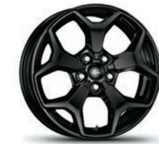
17" Painted Aluminum XLT Standard