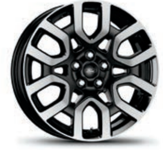
18" Bright Aluminum LARIAT Standard