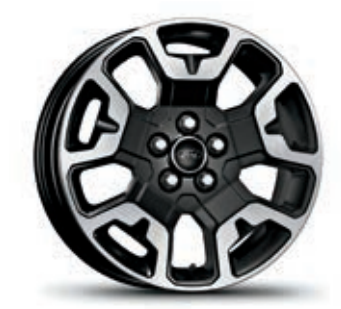
17" Aluminum XLT/LARIAT Optional<sup>2</sup>