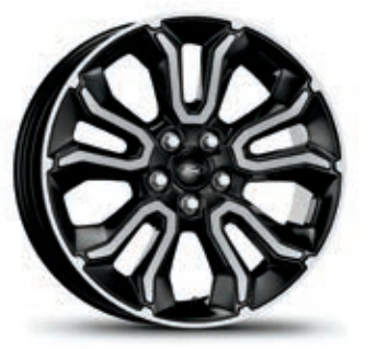
18" Black-Painted LARIAT Optional First Edition Package (hybrid) Included