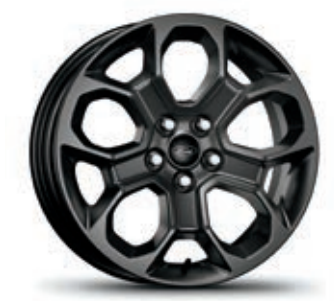
17" Unique Aluminum FX4™ Package Included First Edition Package (gas) Included