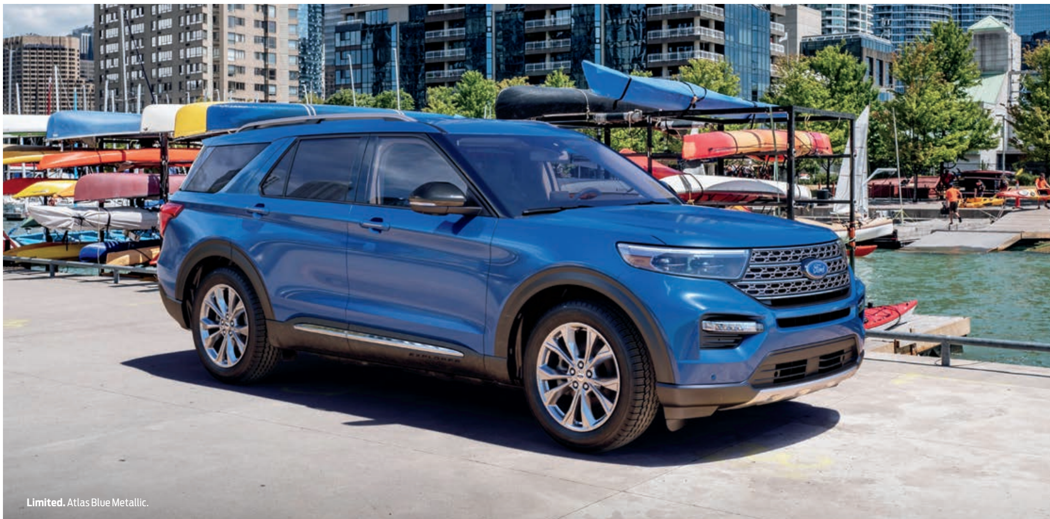
Limited. Atlas Blue Metallic.

A simple press of a button quickly folds down the 3rd-row seat to give you more room. And a 360-Degree Camera with Split-View Display helps you navigate tight spots with ease. In Explorer, there's no limit to convenience.