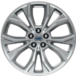
20" PREMIUM PAINTED ALUMINUM Standard