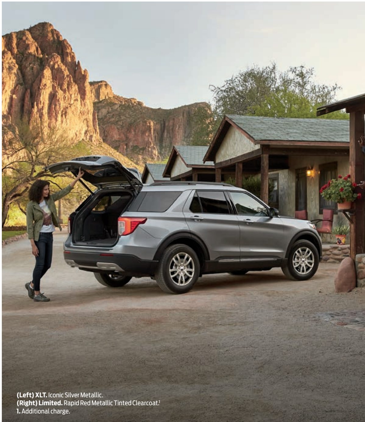
(Left) XLT. Iconic Silver Metallic. (Right) Limited. Rapid Red Metallic Tinted Clearcoat. 1 1. Additional charge.