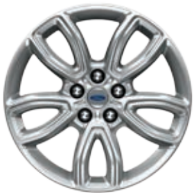
18" PAINTED ALUMINUM Standard