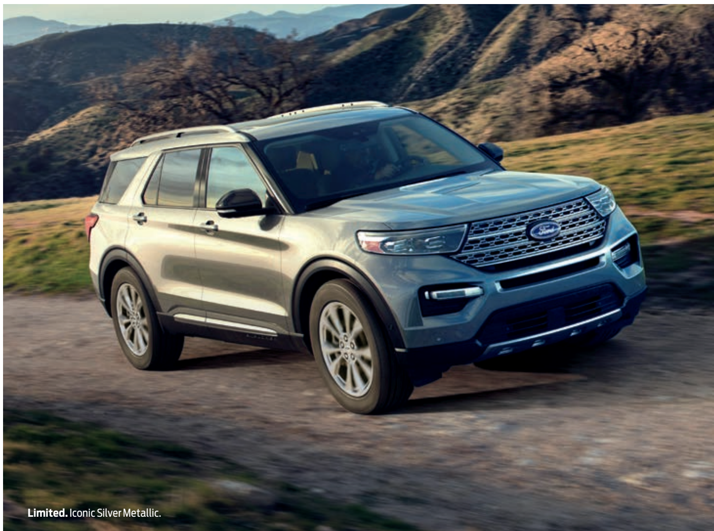
Limited. Iconic Silver Metallic.

Not all roads are created equal, but Ford Explorer SUV levels the playing field with Selectable Drive Modes. Rear-wheel-drive Explorer models offer 6 modes, while available Intelligent 4WD with the Terrain Management System™ offers 7 modes that are easily selected with a simple turn of a dial.