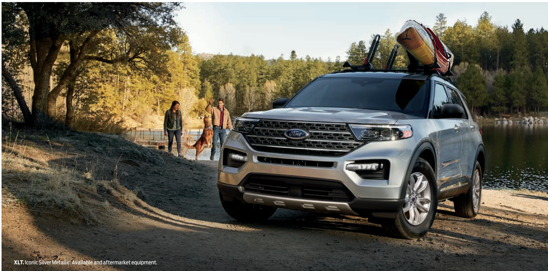
XLT. Iconic Silver Metallic. Available and aftermarket equipment.

At first glance, you can't help but notice the distinctive black mesh grille with chrome bars and signature LED headlamps that make this vehicle a standout. Take a closer look inside, and appreciate the leather-wrapped steering wheel and high-end ActiveX™ Trimmed Seats. And, with standard features like a 10-way power driver's seat, and a 2nd-row 35/30/35 split fold-flat seat with E-Z Entry, it's easy to see why XLT is such a popular choice.