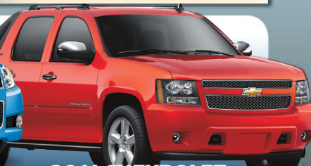
2011 CHEVROLET AVALANCHE

0% for 60 Months APR Financing Available*