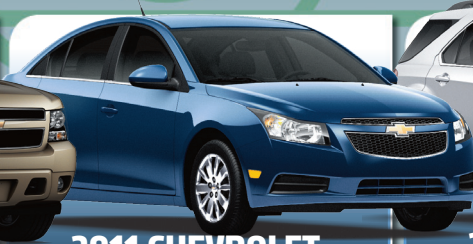
2011 CHEVROLET CRUZE LT

2.9% for 60 Months APR Financing Available*