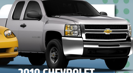
2010 CHEVROLET SILVERADO EXT CAB

0% for 72 Months APR Financing Available*