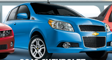
2010 CHEVROLET AVEO

0% for 60 Months APR Financing Available*