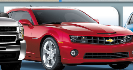
2011 CHEVROLET CAMARO

0% for 72 Months APR Financing Available*