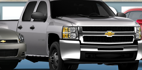
2010 CHEVROLET SILVERADO CREW CAB

0% for 72 Months APR Financing Available*