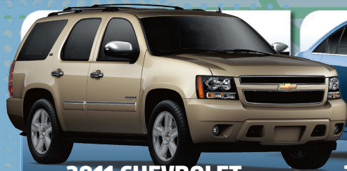
2011 CHEVROLET TAHOE

Just a click away at VandergriffChevrolet.com