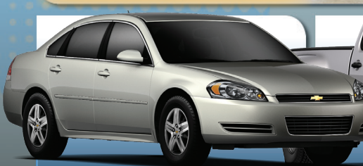
2010 CHEVROLET IMPALA LS

Stock #A1219520 ..... MSRP: $25,575 Vandergriff Discount: $598 ..... Total Rebates $4,000