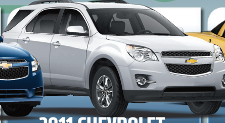
2011 CHEVROLET EQUINOX

Stock #B6251243 ..... MSRP: $23,715 Vandergriff Discount: $738