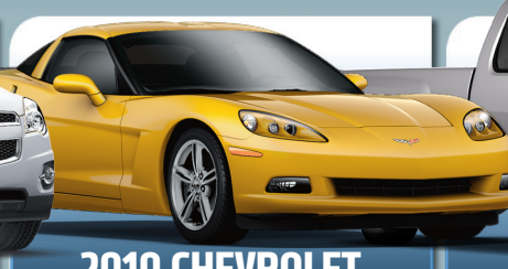
2010 CHEVROLET CORVETTE

2.9% for 36 Months APR Financing Available*