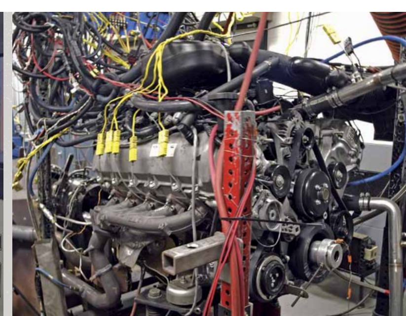
OVM Installation Review