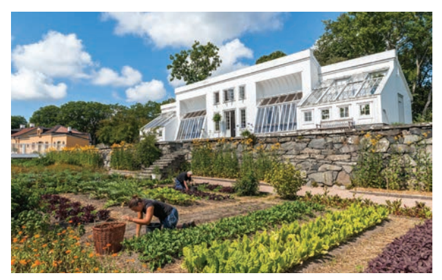
Steampipe Production Studio AB

Take your Volvo for a short drive to Gunnebo Castle and explore the 18th-century castle and its garden. The property has been restored back to the 1700s original footprint - enjoy an organic lunch in their restaurant and then head off to Marstrand - a summer resort often referred to as the Yacht Club of Sweden. Check in at Marstands Havshotell and enjoy the SPA, a walk and a delicious dinner.