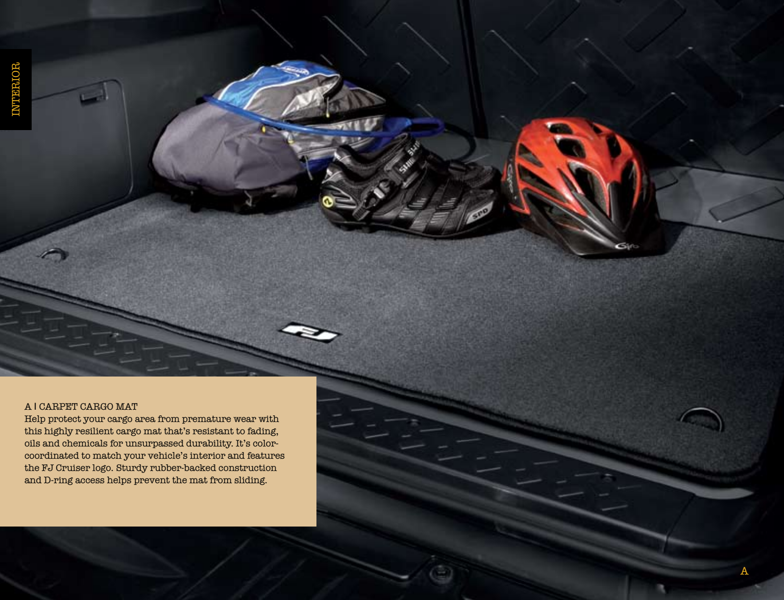
A | CARPET CARGO MAT Help protect your cargo area from premature wear with this highly resilient cargo mat that's resistant to fading, oils and chemicals for unsurpassed durability. It's color-coordinated to match your vehicle's interior and features the FJ Cruiser logo. Sturdy rubber-backed construction and D-ring access helps prevent the mat from sliding.