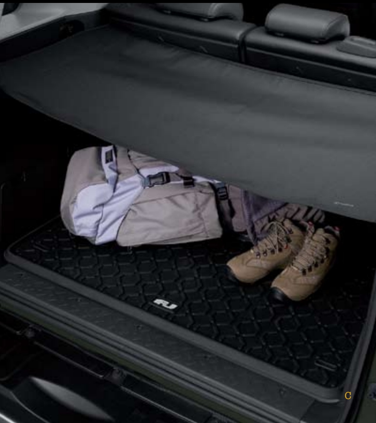
C | CARGO COVER Customized for precise fit to your FJ Cruiser, this handy cargo cover attaches to your rear seats, providing added security for items stored in your cargo area. The cargo area cover is resistant to ultraviolet rays, offering valuable protection against sun damage and fading. Available in black. It's washable and easy to install.