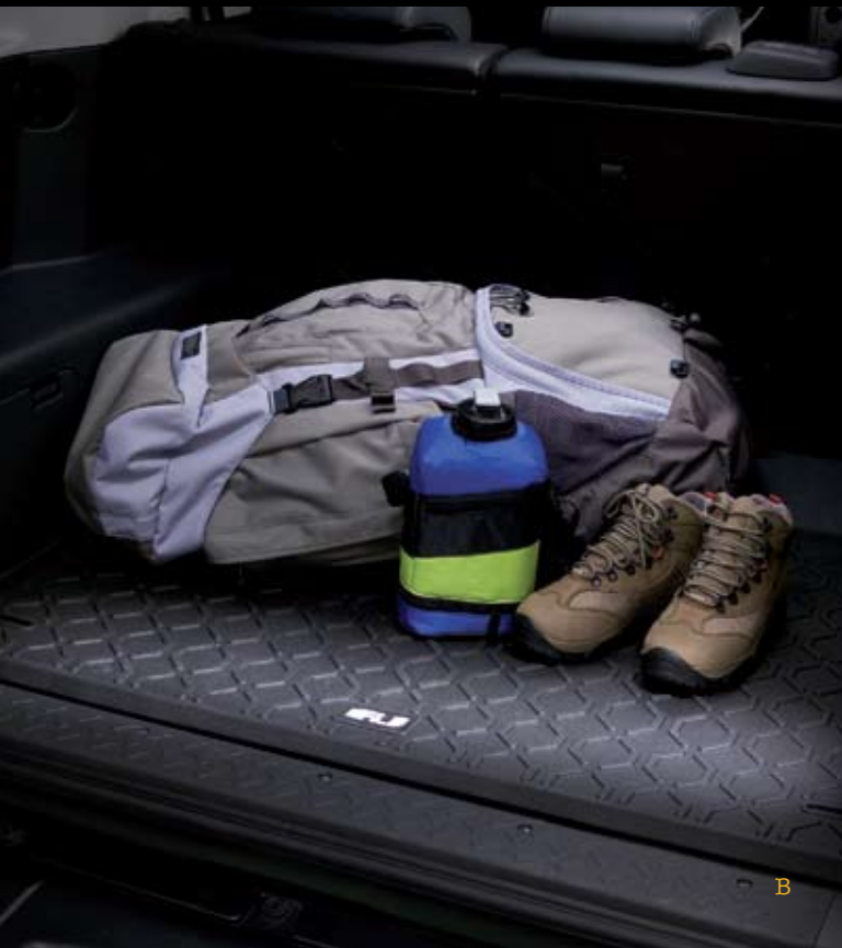
B | ALL WEATHER CARGO MAT Molded for an exact fit for maximum coverage and unrivaled protection of your FJ Cruiser's interior, the all weather cargo mat features a multi-dimensional surface and perimeter "lip" to contain dirt, debris and liquids. A non-slip "nibbed" backing keeps the mat in place, while a custom-molded FJ logo provides an added touch of personalization.