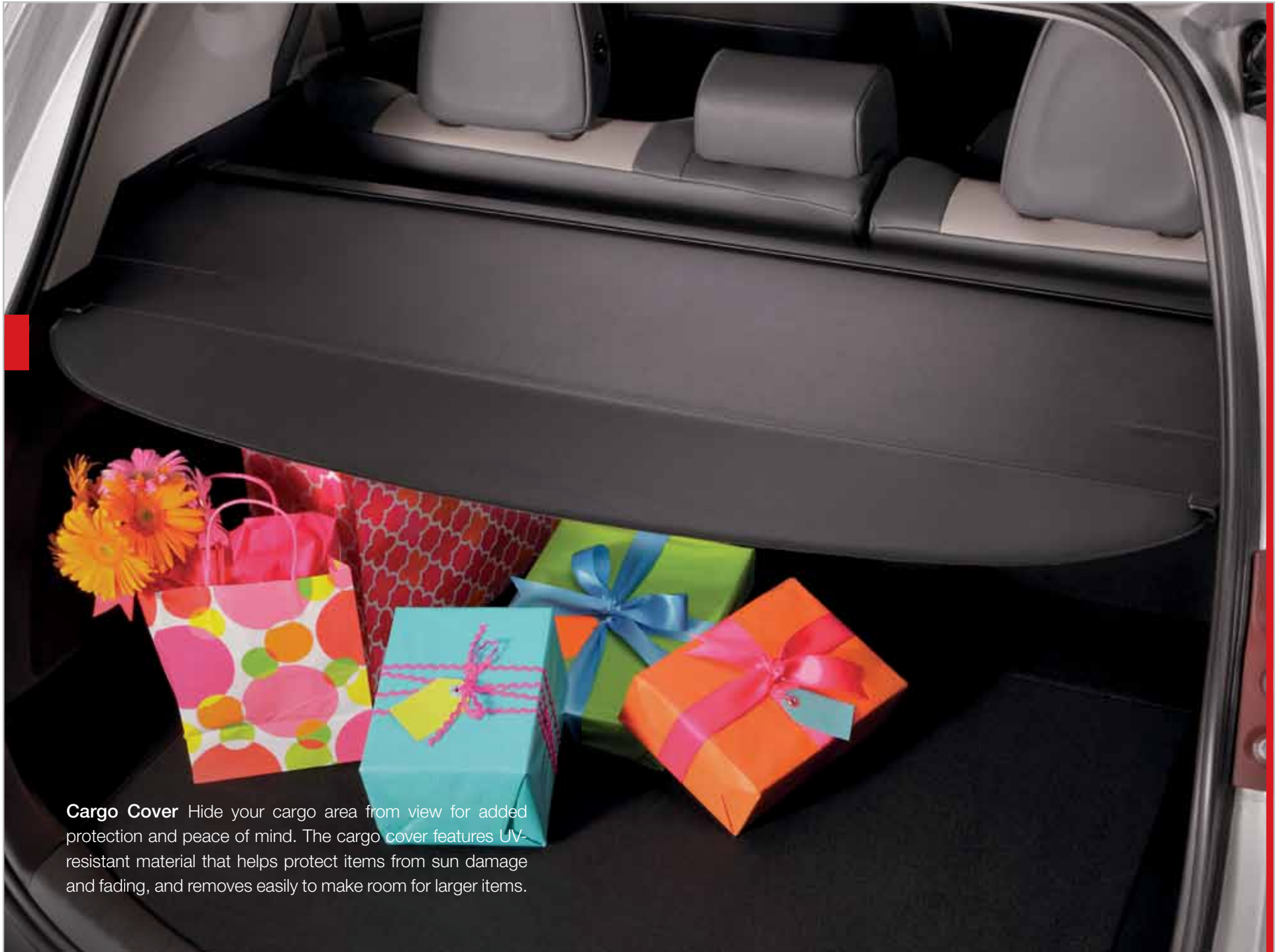
Cargo Cover Hide your cargo area from view for added protection and peace of mind. The cargo cover features UV-resistant material that helps protect items from sun damage and fading, and removes easily to make room for larger items.