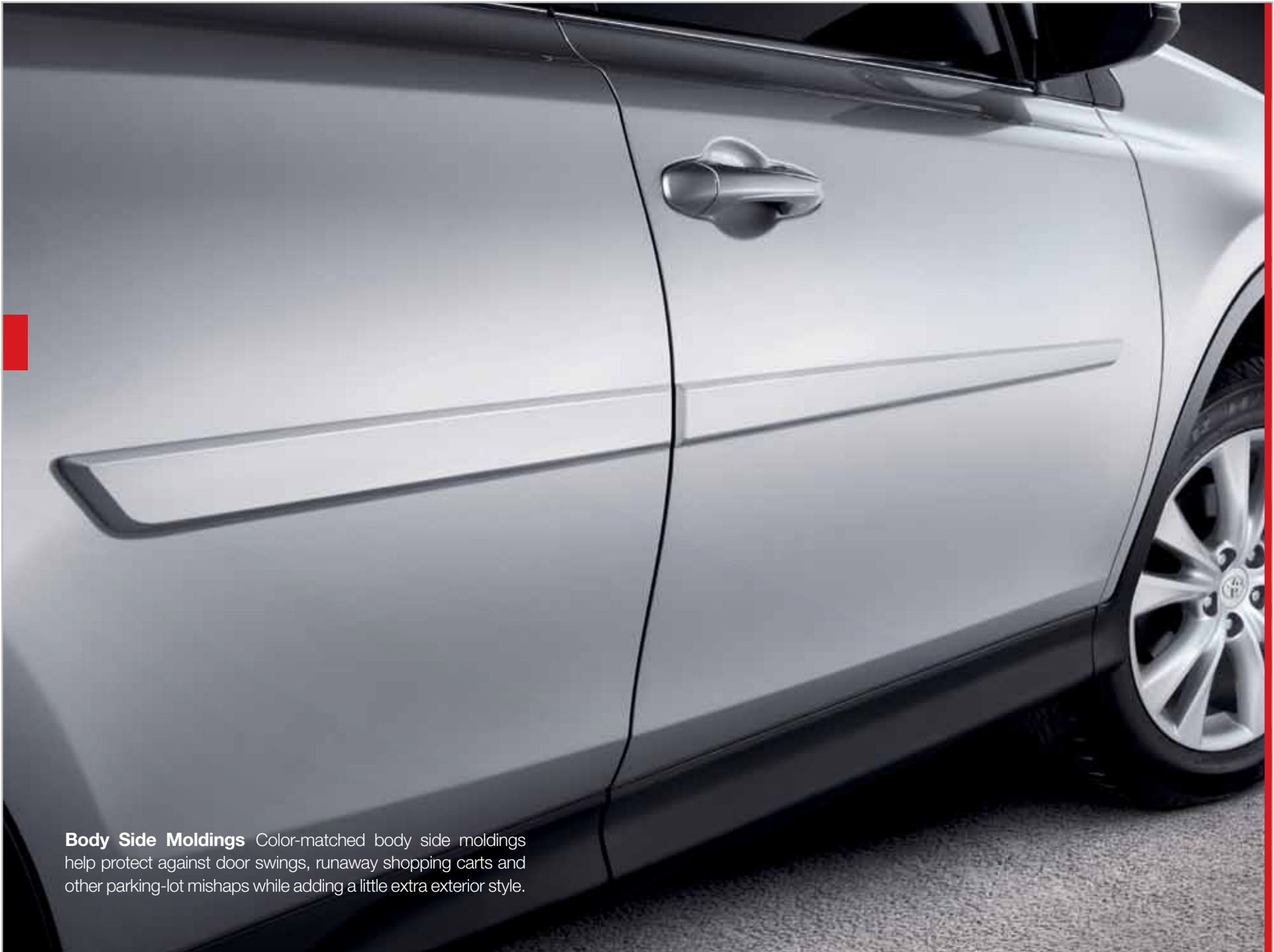
Body Side Moldings Color-matched body side moldings help protect against door swings, runaway shopping carts and other parking-lot mishaps while adding a little extra exterior style.