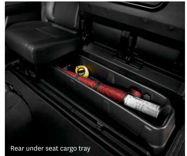
Rear under seat cargo tray