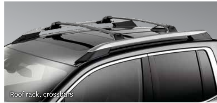
Roof rack, crossbars