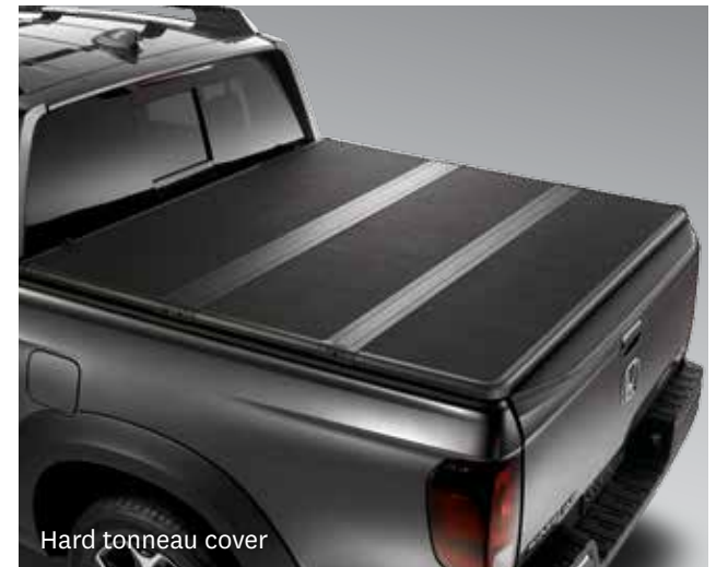
Hard tonneau cover