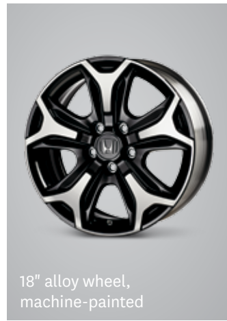
18" alloy wheel, machine-painted