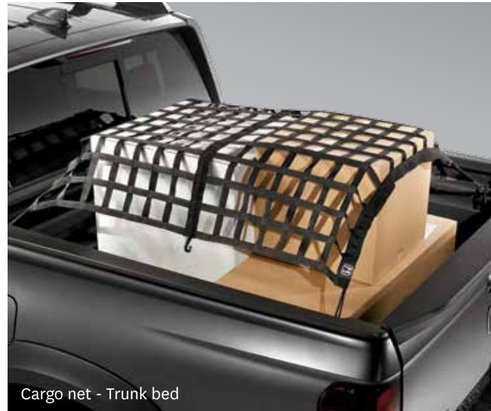
Cargo net - Trunk bed