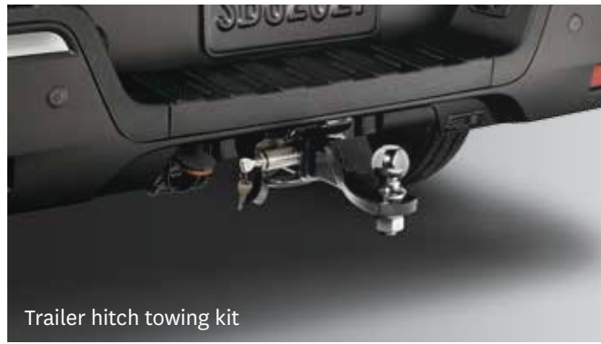
Trailer hitch towing kit