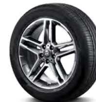
Available 19" alloy wheel

Choice of interior colour depends upon model and/or exterior colour selection. Due to the print production process, the colours shown throughout this brochure may vary slightly from the actual hue. Textures may not be exactly as shown. Visit hyundaicanada.com or see your dealer for details.