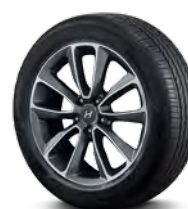
Standard 18" alloy wheel