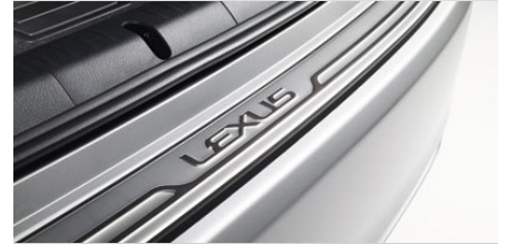
Rear Bumper Protector $224.00*

Load and unload with peace of mind. The rear bumper appliqué helps keep the top surface of your Lexus looking like new. Designed and cut for an exact fit to the vehicle's rear bumper. Made from a durable, UV-resistant, non-yellowing 8-mil clear polyurethane protection film that meets Lexus' rigid engineering standards, the appliqué helps protect the rear bumper from minor scratches, gouges and marring. Stain-, chemical- and fuel-resistant, the rear bumper appliqué is finished with an integrated, pearl-coated Lexus logo that enhances the vehicle's appearance.