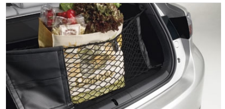
Cargo Net $69.00*

The Cargo Liner provides full protection to the rear cargo area, even when the rear seats are folded down. Featuring an innovative split design, the Cargo Liner provides maximum protection for your cargo area, as well as the back of the rear seats. It also features an anti-slip surface to keep your valuables stable, as well as a raised perimeter lip that helps keep spills limited to the Cargo Liner area.