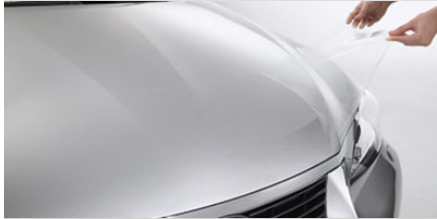
Paint Protection Film $585.00*

Genuine Lexus paint protection film, designed for the hood and front fenders, helps guard your vehicle from weathering, UV radiation and road debris that can chip and scratch the finish. Constructed from durable, nearly invisible thermoplastic urethane, the clear-coated film helps your Lexus maintain a like-new appearance, while allowing you to clean and maintain your vehicle the same as before. Backed by a 7 year limited warranty. At participating dealers only.