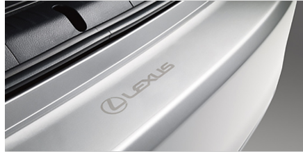
Rear Bumper Appliqué $115.00*

Genuine Lexus paint protection film, designed for the hood and front fenders, helps guard your vehicle from weathering, UV radiation and road debris that can chip and scratch the finish. Constructed from durable, nearly invisible thermoplastic urethane, the clear-coated film helps your Lexus maintain a like-new appearance, while allowing you to clean and maintain your vehicle the same as before. Backed by a 7 year limited warranty. At participating dealers only.