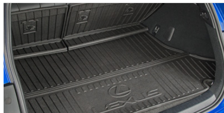
Cargo Liner $185.00*

Custom designed for your Lexus providing 400 watts of heating power. Provides easy cold weather starts reducing engine wear. Provides faster interior warm-up. Includes a 'strain relief' electrical cord.