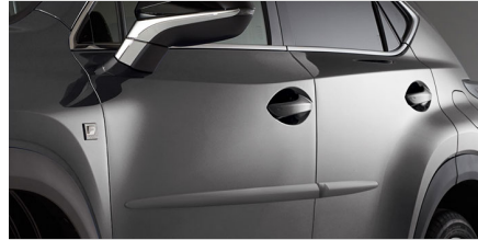
Body Side Moulding $230.00*

Custom designed for your Lexus providing 400 watts of heating power. Provides easy cold weather starts reducing engine wear. Provides faster interior warm-up. Includes a 'strain relief' electrical cord.