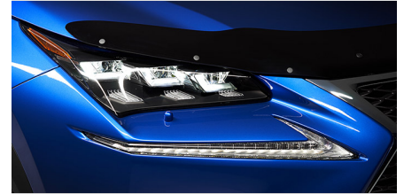
Hood Deflector $195.00*

Sleek and amazingly durable, Lexus body side mouldings feature a high-quality body-color finish and are rigorously tested for impact and chip resistance in extreme climates. They are also designed to resist peeling in high-pressure washing and normal environmental exposure. By protecting the door from scratches, dents and chipping, this premium accessory helps retain the vehicles resale value.