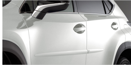
Body Side Moulding $230.00*

Custom designed for your Lexus providing 400 watts of heating power. Provides easy cold weather starts reducing engine wear. Provides faster interior warm-up. Includes a 'strain relief' electrical cord.