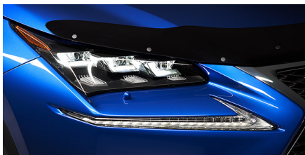
Hood Deflector $195.00*

Sleek and aerodynamic, the Lexus Genuine Cross Bars is a necessity for owners on the move. Designed to enhance the versatility and convenience of your Lexus, these lightweight yet high-strength finished aluminum cross bars complement the body's styling of the NXh. The cross bars are easily adjustable when cargo-carrying needs change. They are both corrosion and fade-resistant, and load-rated for carrying almost any size load up to 176 lb (80 kg)*. Only available on selected NXh models, check with your Dealer for applicability. *Roof rack capacity is limited. See Owner's Manual for details.