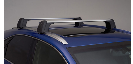
Cross Bars $414.00*

Sleek and amazingly durable, Lexus body side mouldings feature a high-quality body-color finish and are rigorously tested for impact and chip resistance in extreme climates. They are also designed to resist peeling in high-pressure washing and normal environmental exposure. By protecting the door from scratches, dents and chipping, this premium accessory helps retain the vehicles resale value.