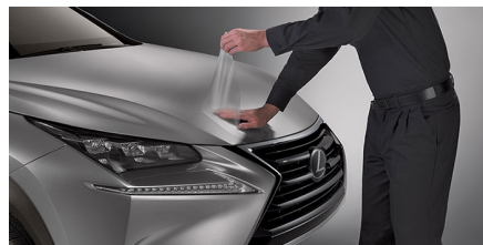
Paint Protection Film $585.00*

Enhance the appearance of your vehicle with this high-strength impact resistant tinted acrylic hood deflector. It's designed for a quality fit and matches the contour of your hood. Aerodynamically designed to deflect airflow over the hood of your vehicle. It helps reduce hood paint chipping from road debris and keeps leading edge of your hood free from insects. Easy to install featuring a 'no-drill' attachment system.