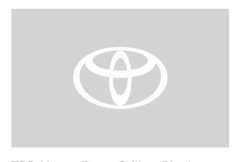
TRD Upper Front Grille - Black $256.20

Keep your oil pure as long as possible, and help enhance the life of your engine, with the TRD Oil Filter that kicks out impurities through a 100% synthetic fiber filtration medium.