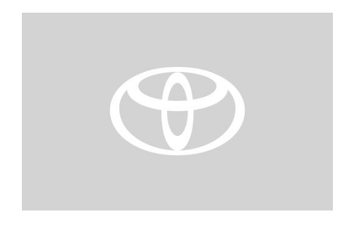
Hard Tri-Fold Tonneau Cover $1,459.20

Guard your vehicle from weathering, UV radiation and road debris that can chip and scratch the finish with Genuine Toyota Paint Protection Film. This durable and nearly invisible thermoplastic urethane is designed to protect the hood and front fenders to maintain a like-new appearance to your Toyota. Backed by a 7 year limited warranty. At participating dealers only.