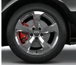
17" Brooklyn alloy wheel 3D