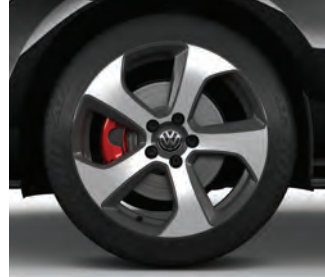
18" Austin alloy wheel 3DA/5DA