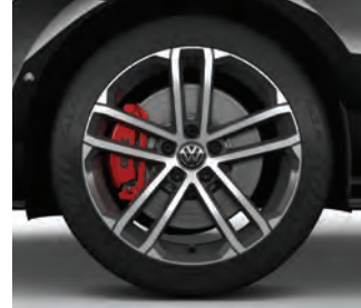
18" Nogaro alloy wheel 5DP