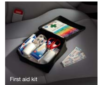
First aid kit