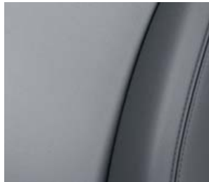
SOFTEX® TRIM in Dark Gray