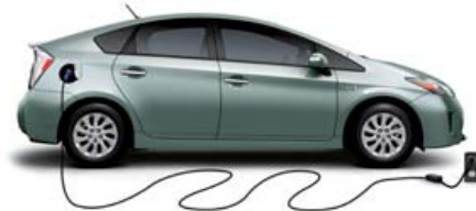
SEA GLASS PEARL