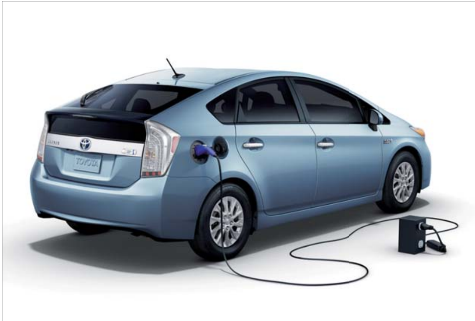
Prius Plug-in Hybrid shown in Clearwater Blue Metallic.