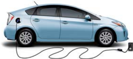
CLEARWATER BLUE METALLIC