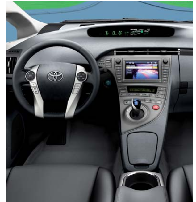
Interior shown with Dark Gray SofTex®-trimmed seats.

The 2014 Toyota Prius Plug-in is one amazing ride with two ways to help achieve great mileage. In hybrid mode, it operates like a Prius and earns a remarkable EPA-estimated combined mileage rating of 50 mpg; 1 in EV Mode, 2 it offers you an EPA-estimated 95 mpge. 3 Should you run out of electric charge, Prius Plug-in will seamlessly shift back into hybrid mode. It also features a quick three-hour charge time from a standard 120V AC household outlet, 4 or about half that time if you use a 240V outlet.* Let's go places.