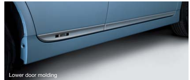
Lower door molding

See numbered footnotes in Disclosures section.