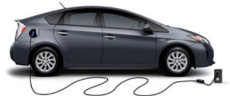
WINTER GRAY METALLIC