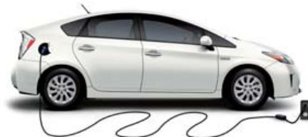
BLIZZARD PEARL 1