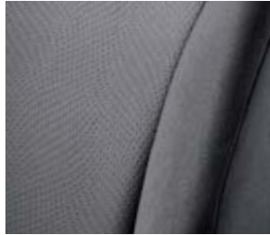
FABRIC in Dark Gray