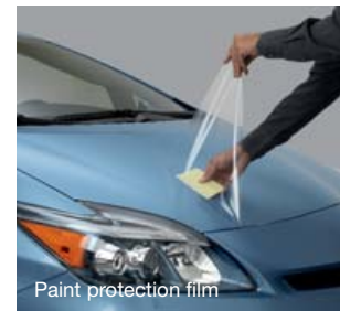
Paint protection film