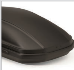
Roof cargo box