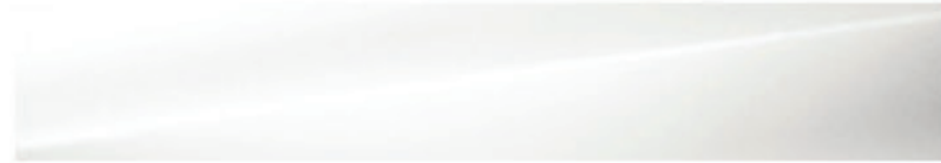
Snow White Pearl (P)