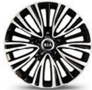
18" machined-finish alloy wheel