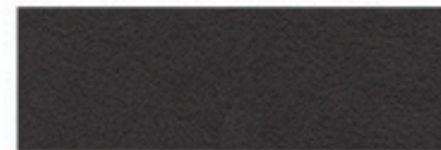
Black Nappa Leather