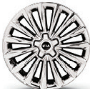
19" chrome alloy wheel