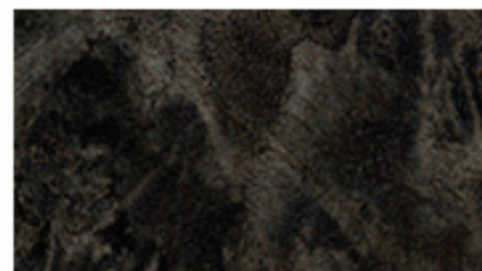
Poplar Wood (Special order*)

*Available only with special order on V8 Elite model with Snow White Pearl exterior.