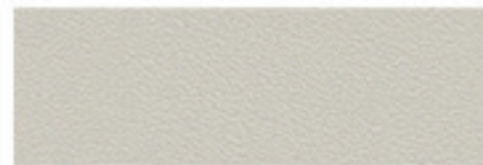
White Nappa Leather (Special order*)