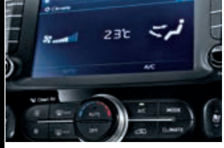
Soul SX comes with a standard

POWER-FOLDING OUTSIDE MIRRORS The available power-folding outside mirrors fold in easily, using a door-mounted switch or simply by unlocking the car. You can also use the Smart Key to automatically fold them in or out.