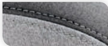
Two-Tone Grey Cloth with Grey stitching (Onyx Black / Inferno Red EV only)