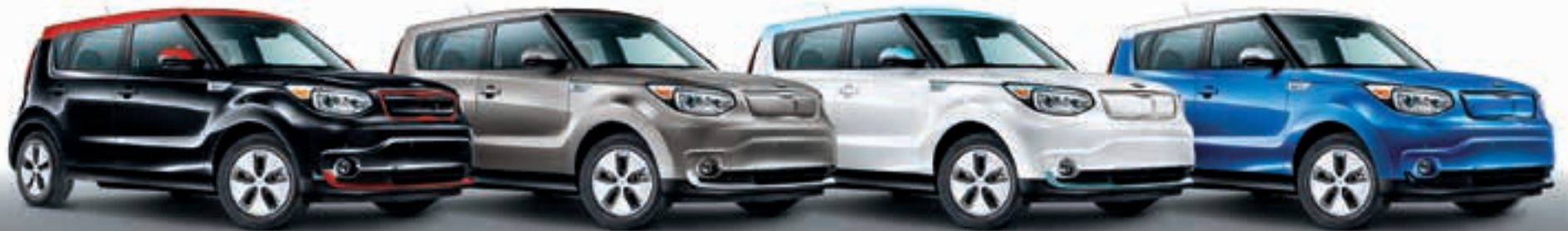
Electronic Blue / Polar White Two-Tone (P)