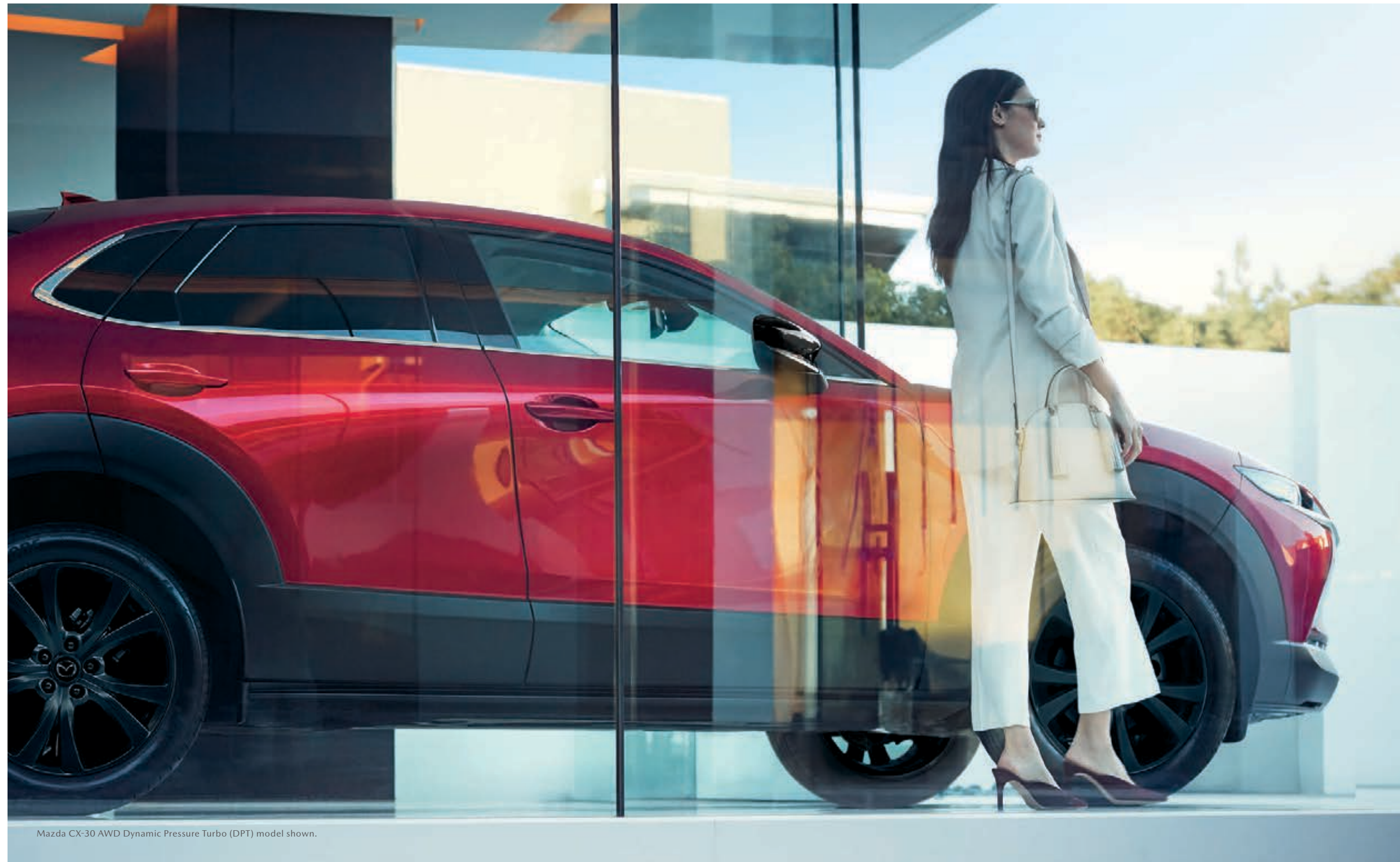
Mazda CX-30 AWD Dynamic Pressure Turbo (DPT) model shown.