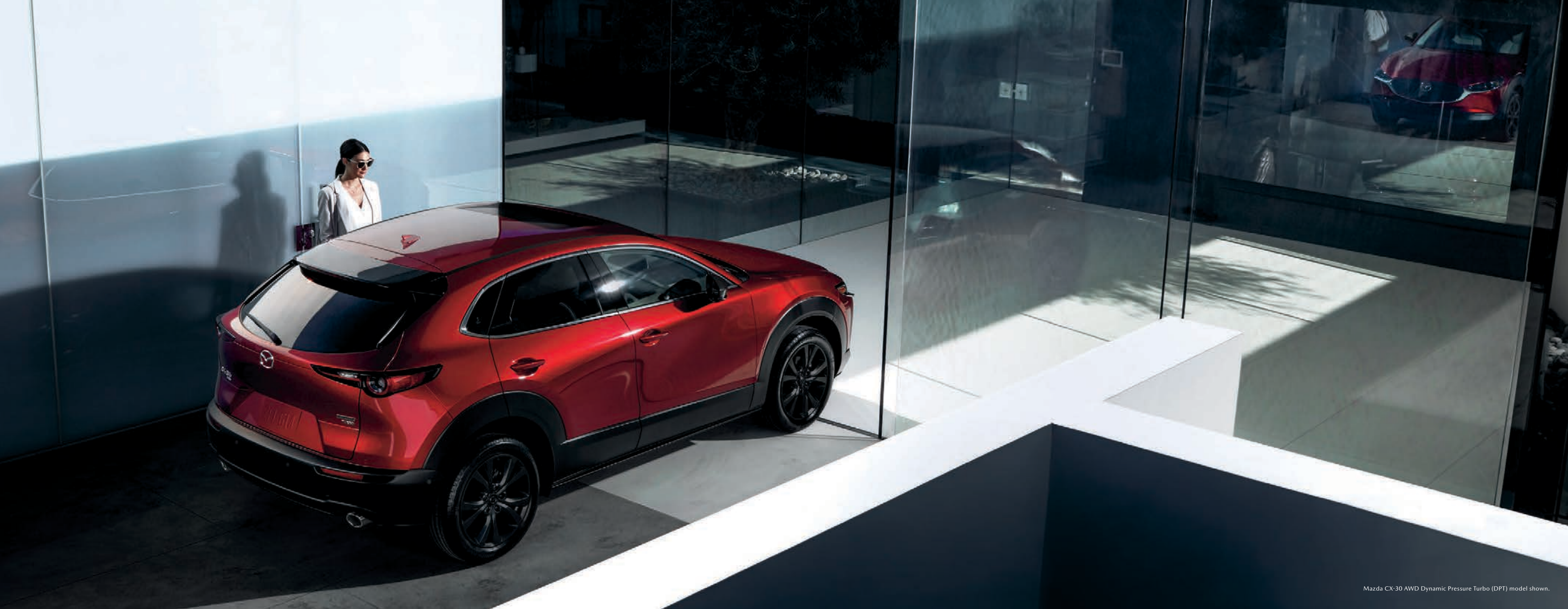
Mazda CX-30 AWD Dynamic Pressure Turbo (DPT) model shown.