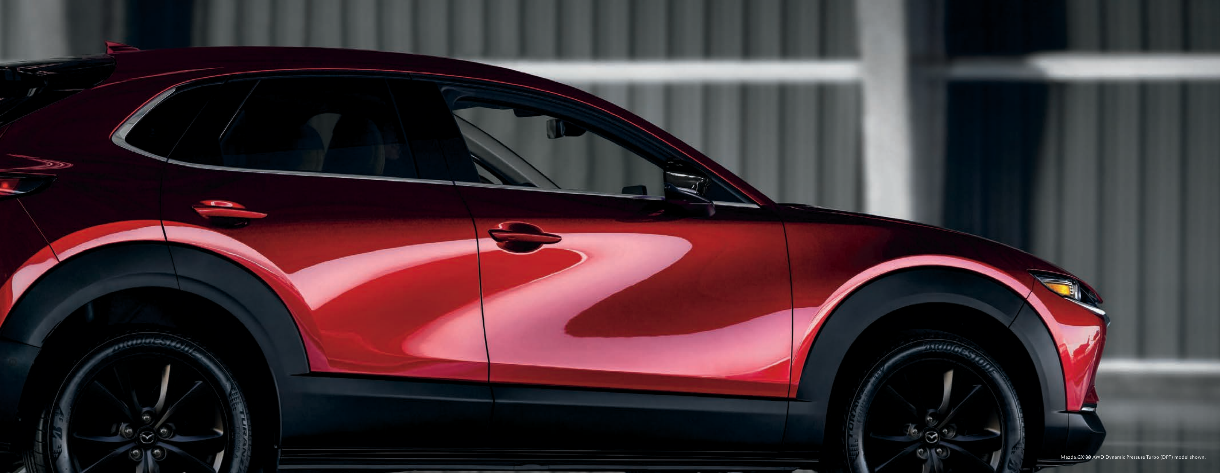
Mazda CX-30 AWD Dynamic Pressure Turbo (DPT) model shown.