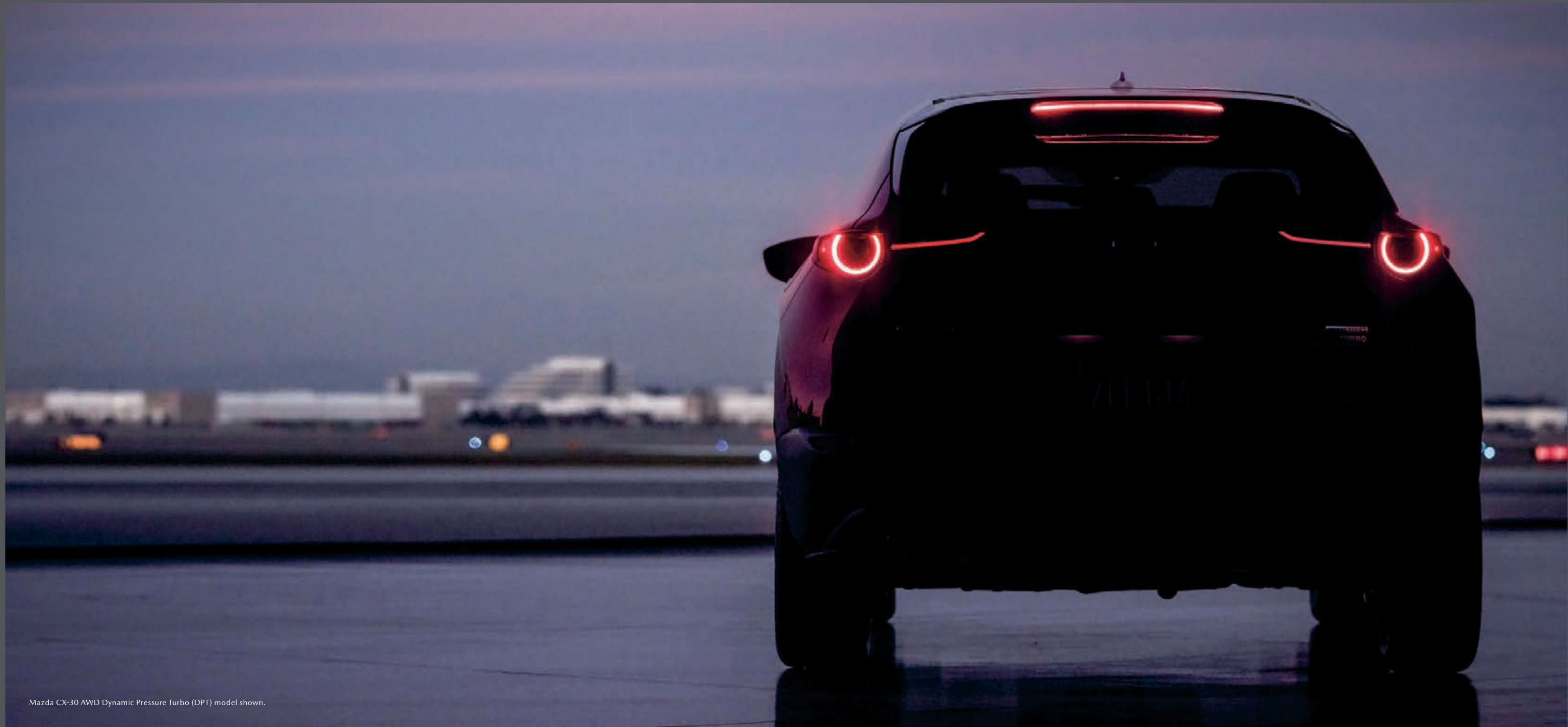
Mazda CX-30 AWD Dynamic Pressure Turbo (DPT) model shown.