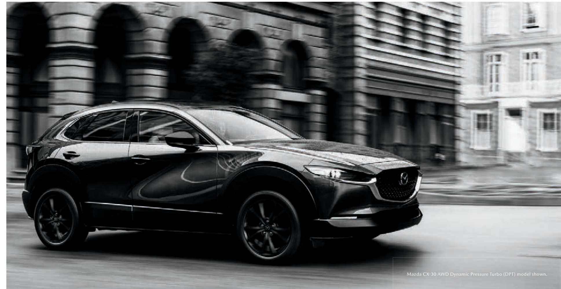
Mazda CX-30 AWD Dynamic Pressure Turbo (DPT) model shown.