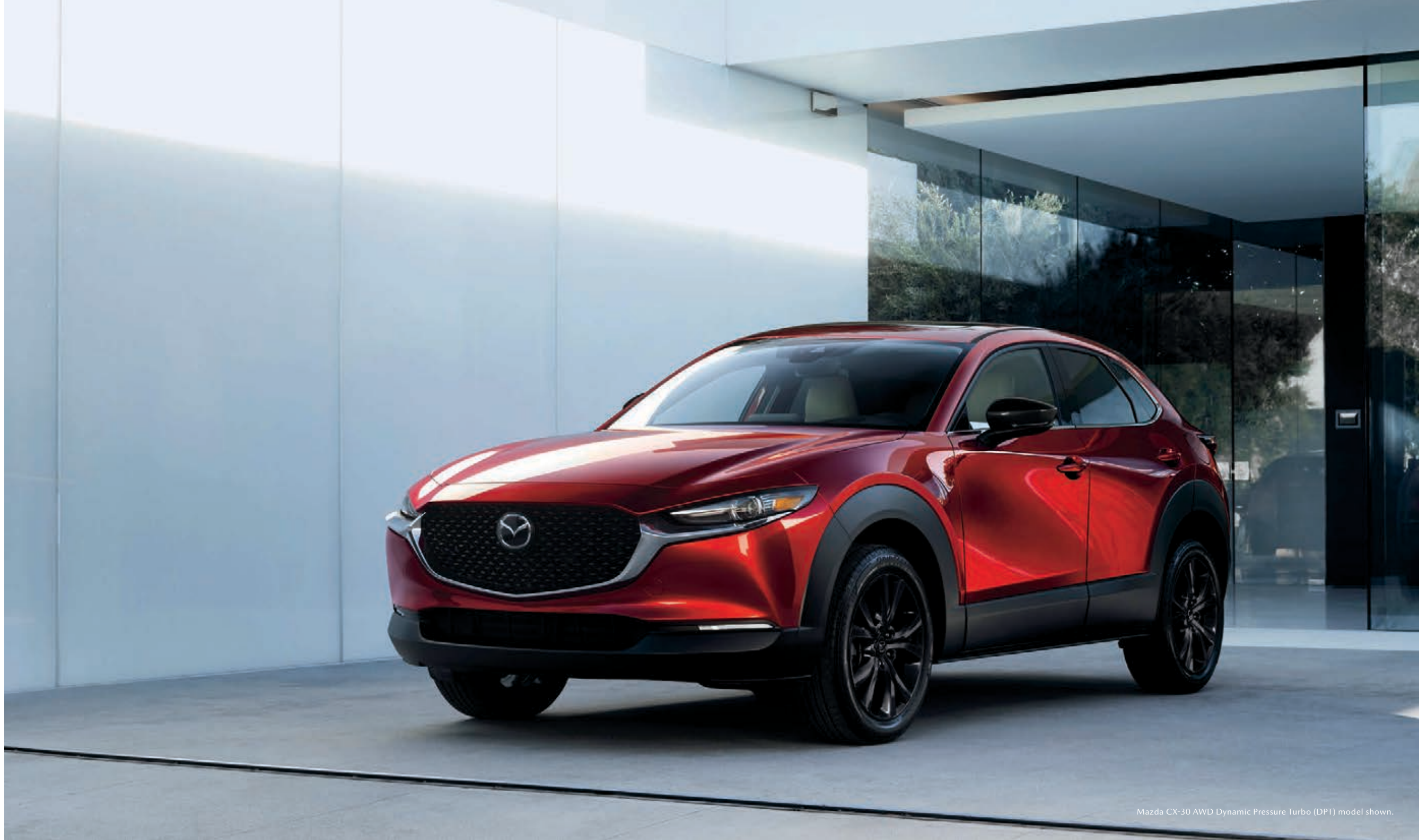
Mazda CX-30 AWD Dynamic Pressure Turbo (DPT) model shown.