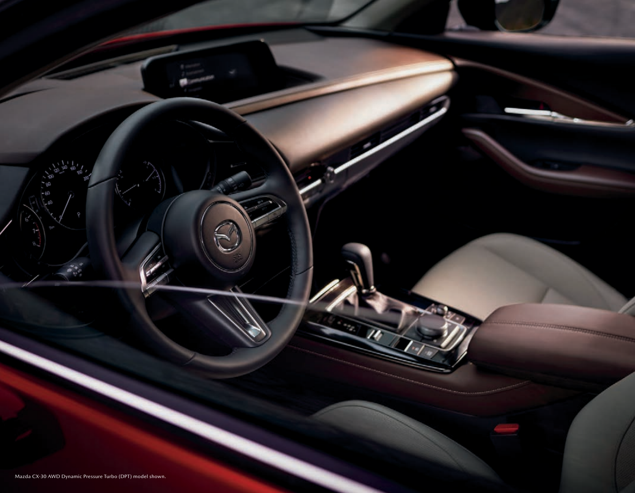
Mazda CX-30 AWD Dynamic Pressure Turbo (DPT) model shown.