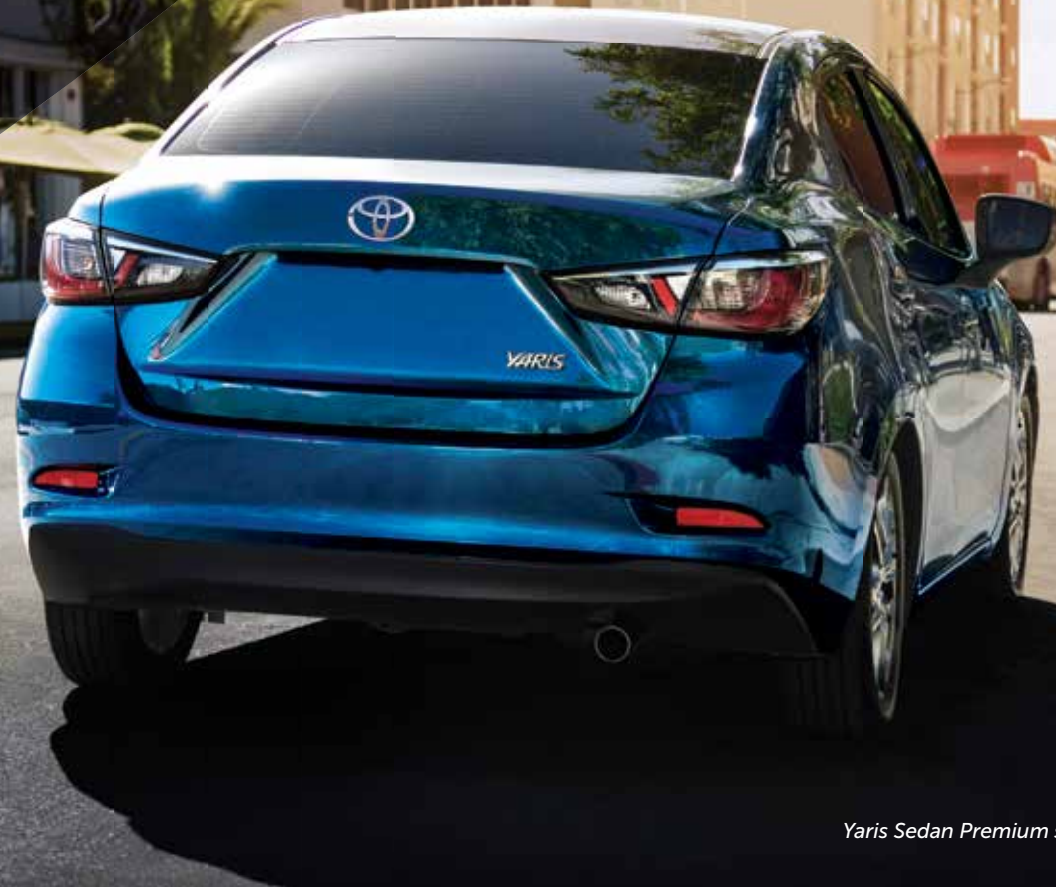
Yaris Sedan Premium shown in Intense Blue Metallic.

Getting from A to B is important, but with the 2016 Yaris Sedan our focus was on everywhere in between. Whether you're chasing passions, connecting with friends in comfort, or making room for everything life requires, Yaris Sedan is the vehicle that gives you the freedom to get around the way you want. And because it's designed with urban roads in mind, the drive isn't only made convenient – it's made fun.