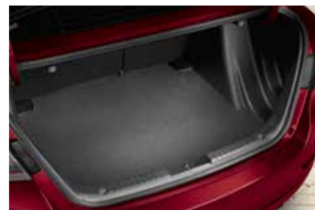
SPACIOUS TRUNK Large and spacious trunk that allows for a ton of practical and useful storage.