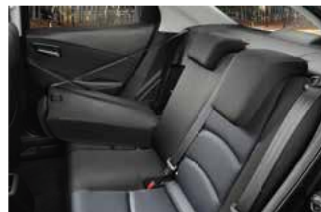
60/40 SPLIT REAR BENCH SEATS Drop the 60/40 split fold-down rear seat to reveal a surprising 382 litres (13.5 cubic feet) of cargo space.

Getting from A to B is important, but with the 2016 Yaris Sedan our focus was on everywhere in between. Whether you're chasing passions, connecting with friends in comfort, or making room for everything life requires, Yaris Sedan is the vehicle that gives you the freedom to get around the way you want. And because it's designed with urban roads in mind, the drive isn't only made convenient – it's made fun.