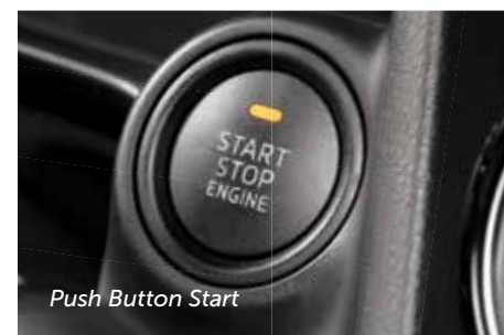
Push Button Start

DISPLAY AUDIO SYSTEM 4 The available Display Audio System 4 offers a seamless way to stay connected. The system features a 7-inch touch-screen with Bluetooth ®3 wireless music streaming, and an Auxiliary Input Jack with two standard USB ports for those who prefer to bring their own soundtrack when out on the road.