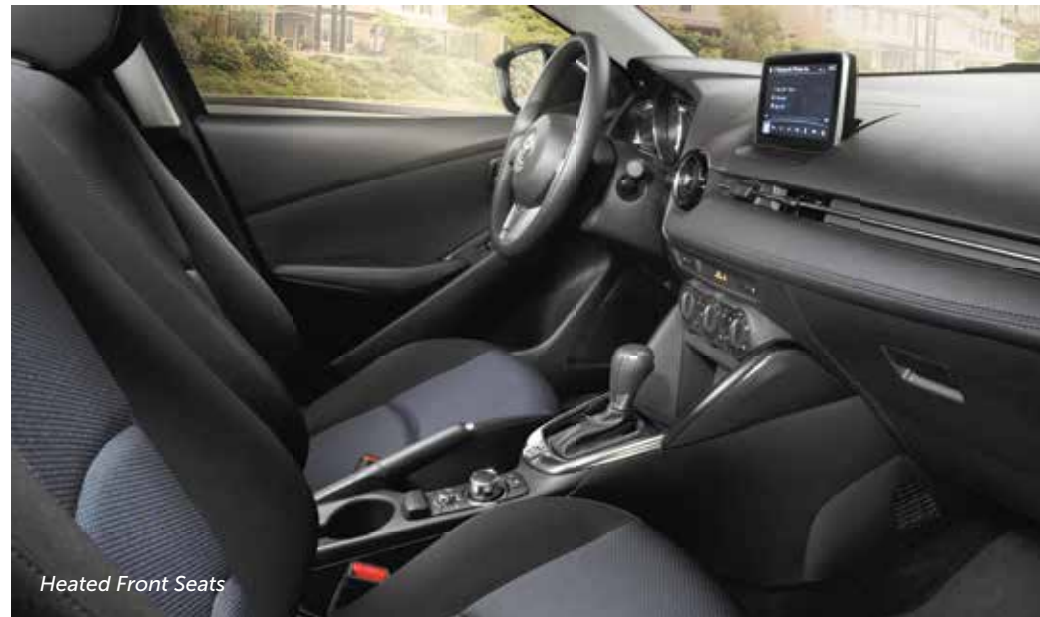
Heated Front Seats