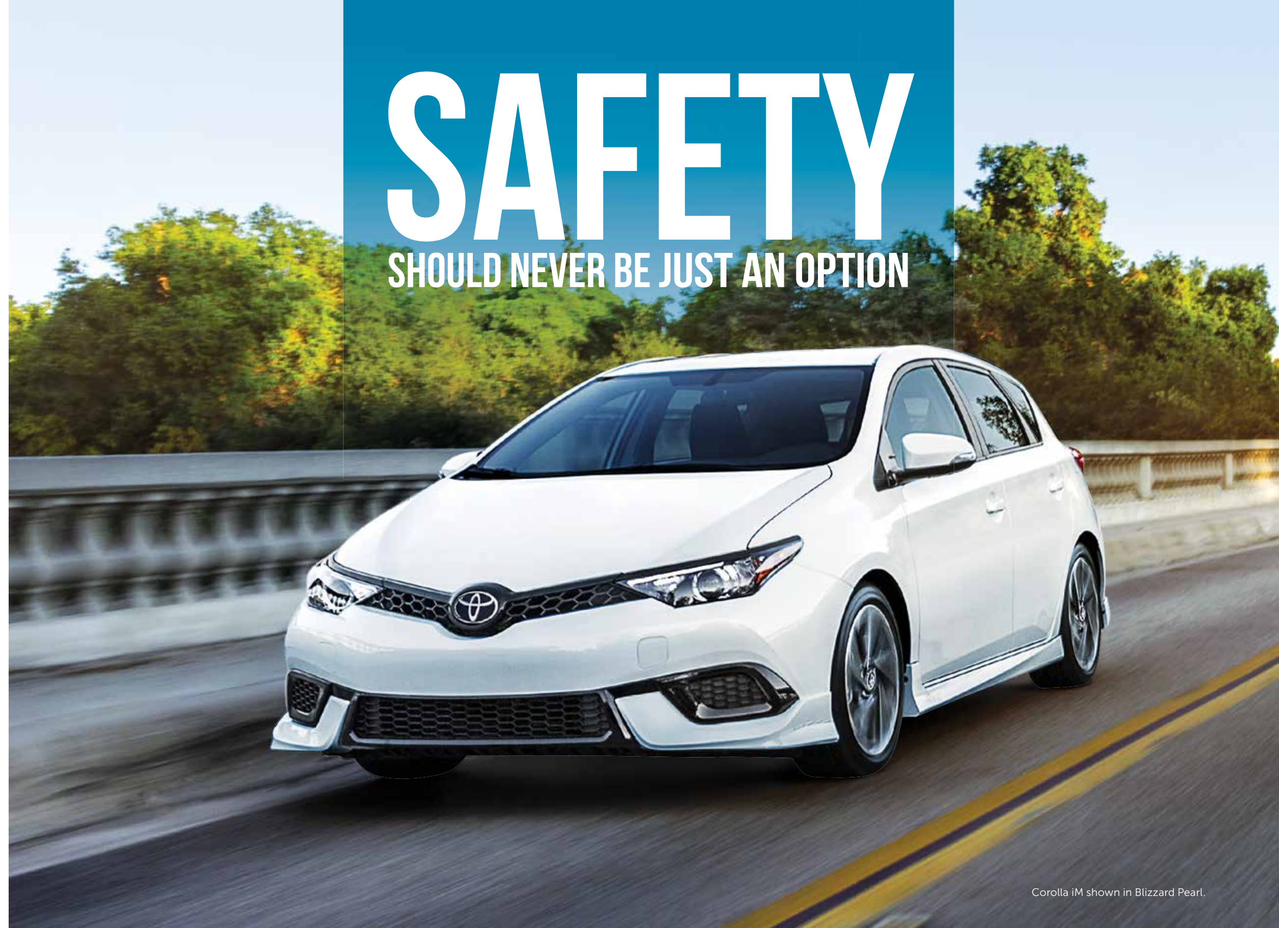
Corolla iM shown in Blizzard Pearl.