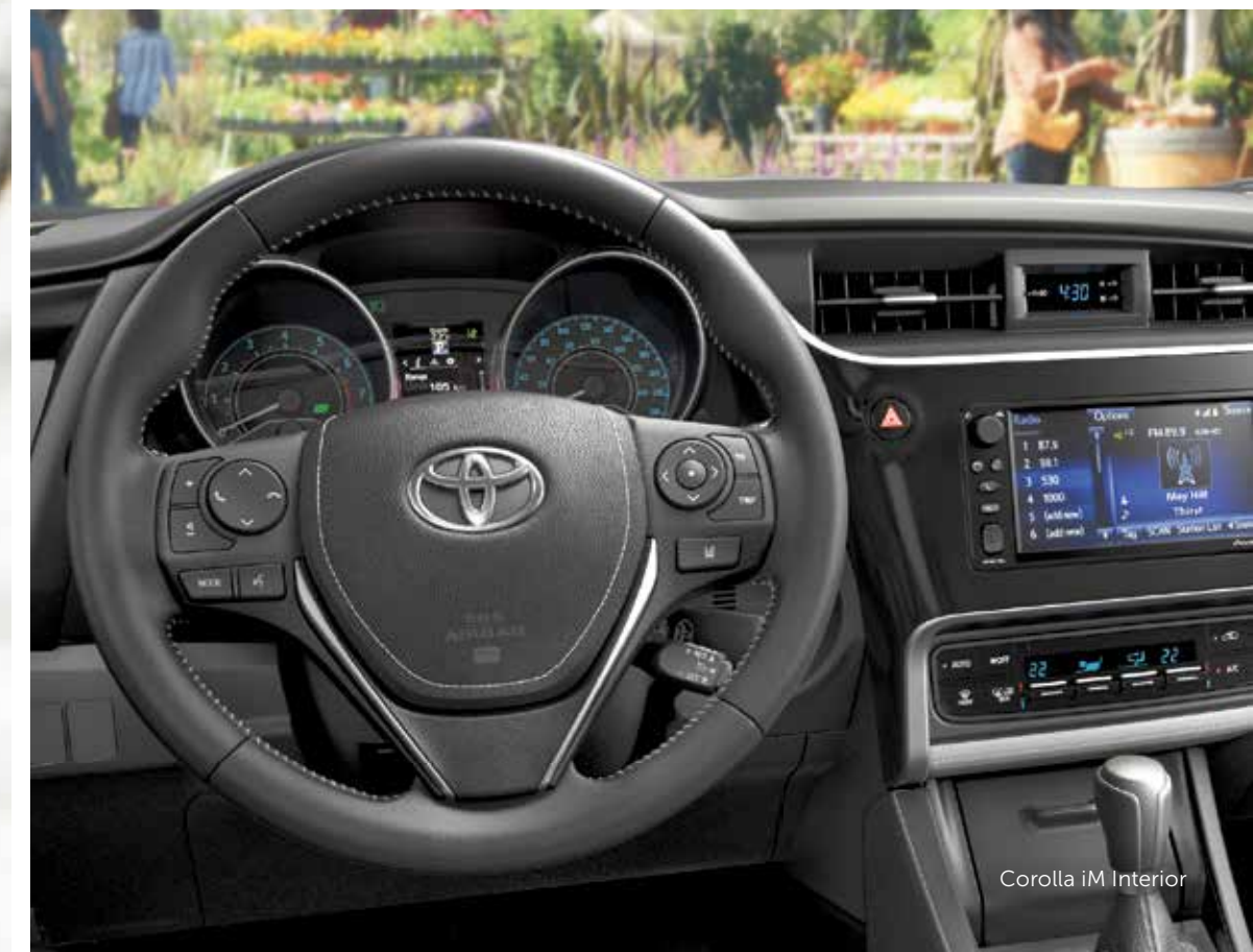
Corolla iM Interior