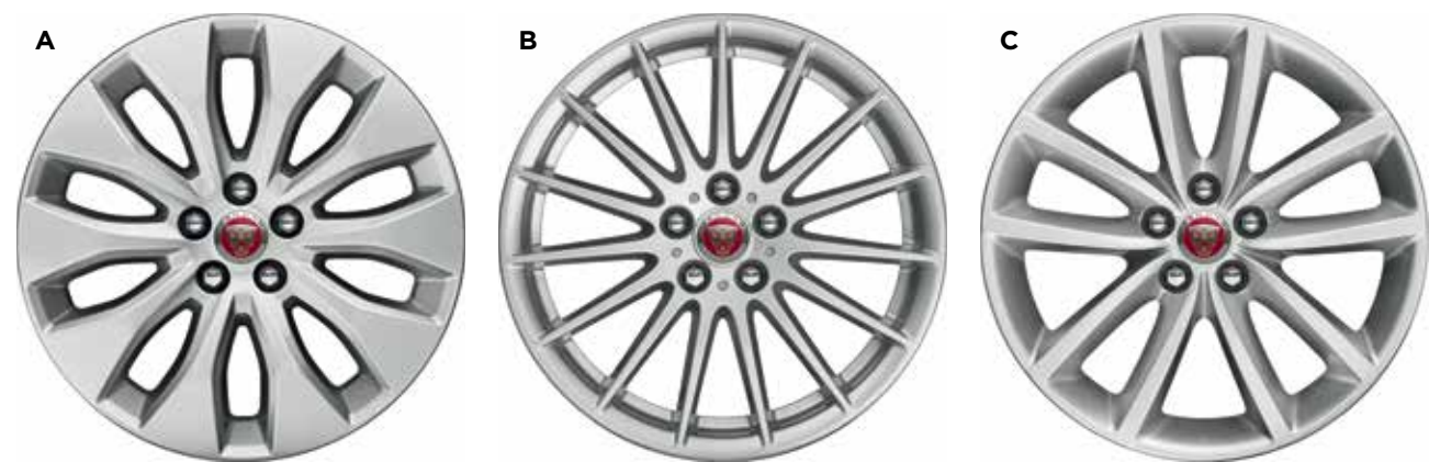
A. 18" AERODYNAMIC - 10 SPOKE - SILVER T4A2304

Bold. Beautiful. And still a functional fit for an all-rounder. But don't stop there—accentuate and adorn with custom valve caps, lug nuts, and center badges.