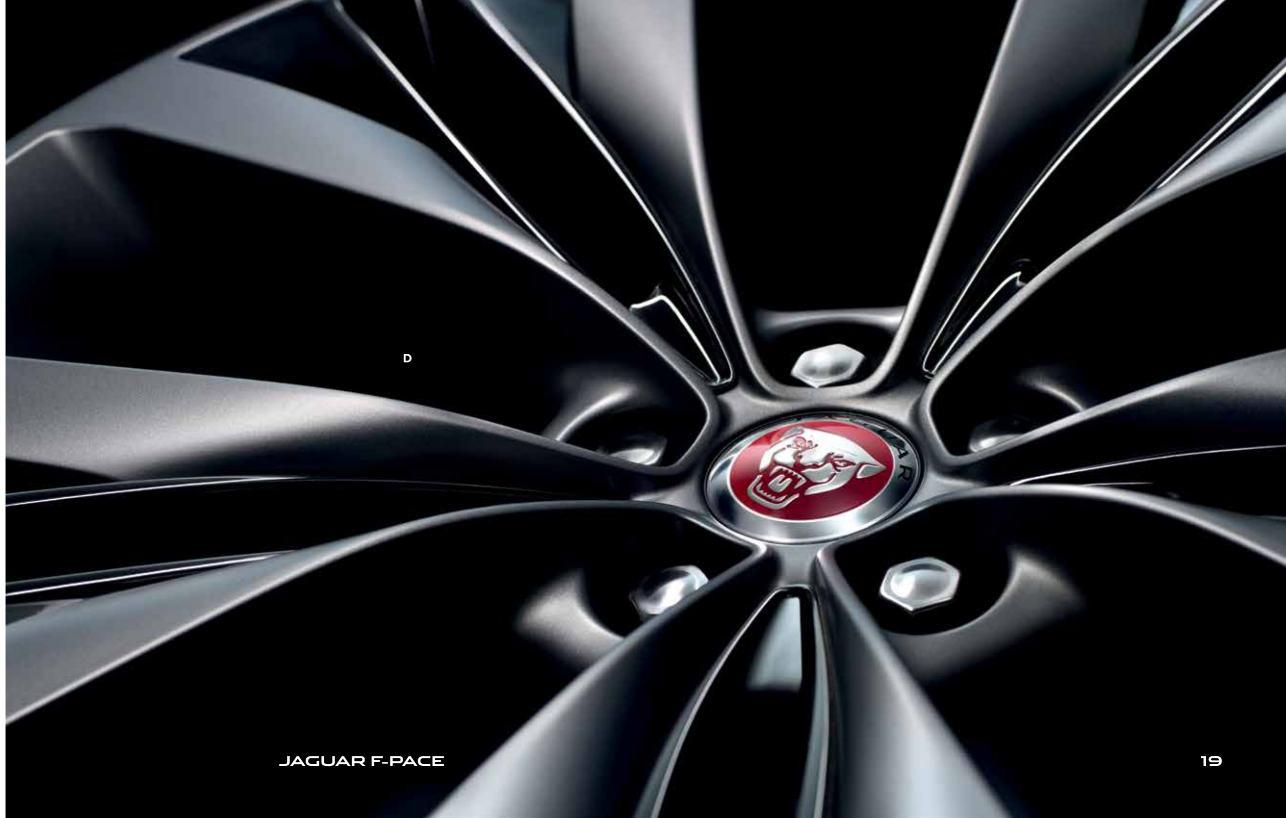
D. 22" DOUBLE HELIX - 15 SPOKE - BLACK WITH DARK INSERTS T4A3797