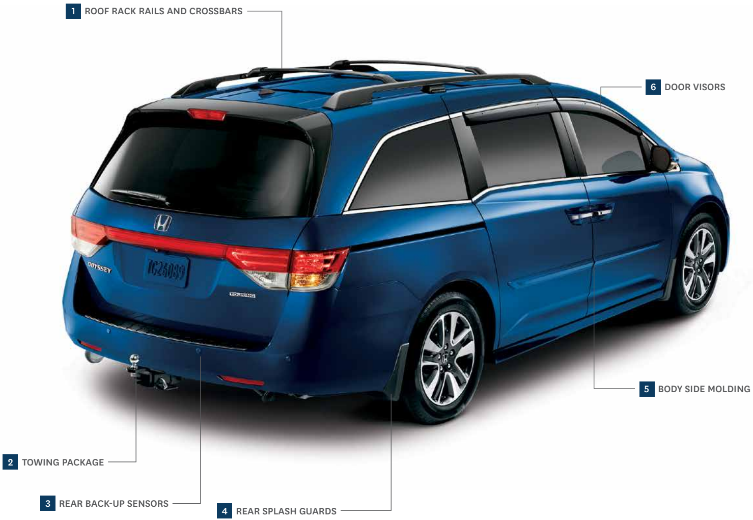
1 ROOF RACK RAILS AND CROSSBARS