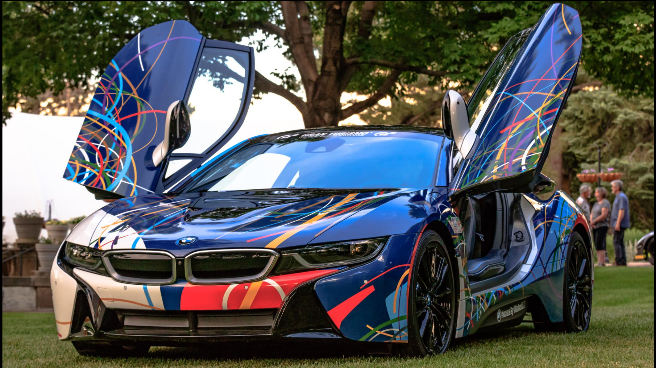
Winslow BMW i8 Wrapsody design by Franck Rive 2018 Pikes Peak International Hill Climb Parade of Champions Pace Car