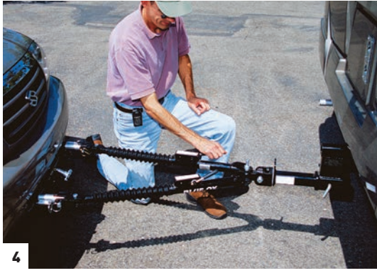
[1] Baseplate installation doesn't require welding or specialized tools, but can be rather involved. If you have any reservations, hire a professional. [2] To hook up a telescoping tow bar, the dinghy vehicle only needs to be near the center and midlength of the bar. [3] Connecting tow-bar arms to the baseplate requires the use of pins and clips. Next, secure the safety cables and plug in the electrical umbilical cord. [4] Once the pins are in, the motorhome is driven ahead slowly (or the dingly is backed up) to lock the arms in place.

operation. Highly adaptable, self-aligning tow bars fit a wide range of vehicles by attaching to model-specific baseplates: Class III (5,000-pound) or Class IV (10,000-pound) models are available. Contact the tow-bar manufacturers for baseplate applications.