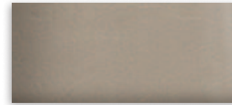
5 Dune Leather