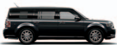
Tuxedo Black Metallic