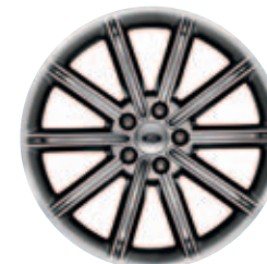
19" Painted Aluminum Standard

High-intensity discharge (HID) headlamps.