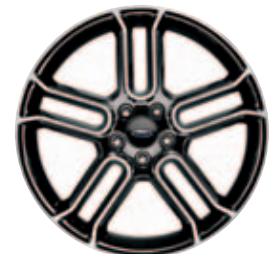
20" Machined Aluminum with Premium Painted Pockets Included: Appearance Package