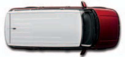
○ White Suede roof Ruby Red Metallic Tinted Clearcoat lower