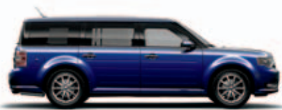
Deep Impact Blue Metallic