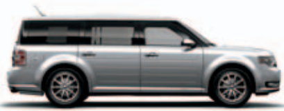
Ingot Silver Metallic