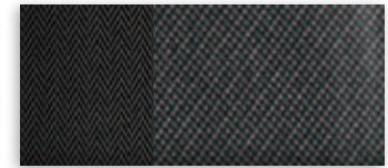
2 Charcoal Black Cloth