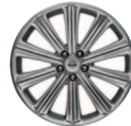
20" Bright-Painted Aluminum Available: SEL