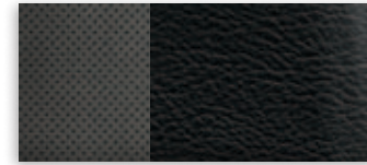
7 Charcoal Black Leather with Gray Perforated Inserts