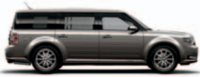
Mineral Gray Metallic