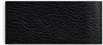
6 Charcoal Black Leather