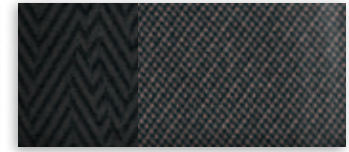
4 Charcoal Black Cloth