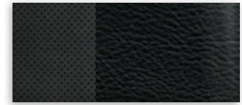
9 Charcoal Black Leather with Perforated Inserts