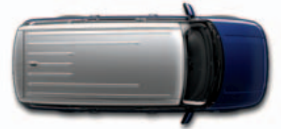
● Ingot Silver Metallic roof Deep Impact Blue Metallic lower