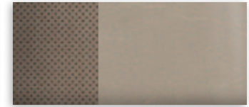
8 Dune Leather with Perforated Inserts