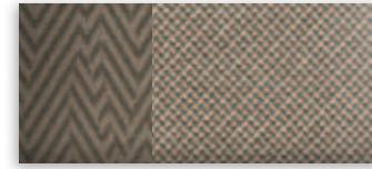
3 Dune Cloth