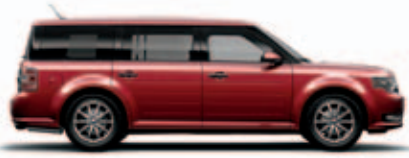
Ruby Red Metallic Tinted Clearcoat