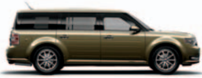
Ginger Ale Metallic