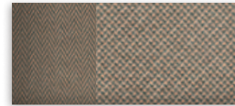
1 Dune Cloth