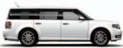
White Platinum Metallic Tri-coat