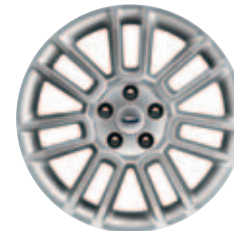
18" Painted Aluminum Standard: SEL