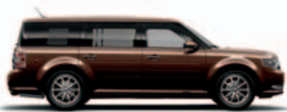
Kodiak Brown Metallic