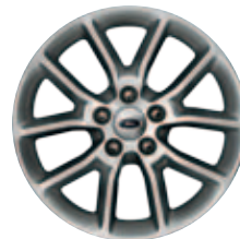
17" Painted Aluminum Standard: SE